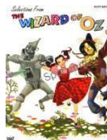
Wizard of Oz*

Another great motivational tool is SmartMusic . This computer software contains accompaniments to ALL the songs in our book, plus many other method books! All the notes come appear on the computer screen. Students can speed up or slow down the music, as well as record themselves, email the recordings, even burn a CD! It includes a built in tuner and metronome. All you need is a computer with speakers, a cheap $10 microphone, and a $30 subscription to SmartMusic. Check it out at: