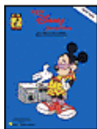
Easy Disney Favorites*