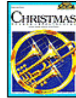
Christmas Sounds Spectacular*