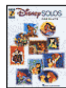
Various Disney Collections