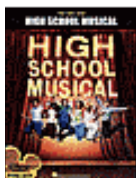
High School Musical (2)